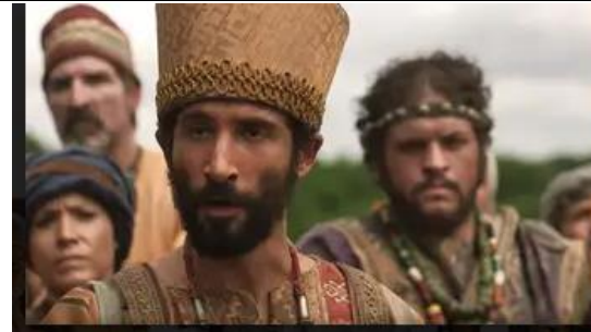
Viewing & Discussion of the "The Chosen" Thursday, April 20th at 6:30 PM in the Office Meeting Room.

This year our summer festival is on July 28 from 6:00pm to 9:00pm. The doors will open at 5:30pm. The festival will be held in the Family Life Center here at Assumption Church in Mire. The tickets are $100.00 and will admit two people. There will be three drawings of $500.00 each. Each person will enjoy boiled shrimp, a corn on the cob and potatoes. You will be able to drive up and receive your meals if you do not wish to stay for the auctions. There will be a live auction, a silent auction and a cash bar. Please join us for our annual fund raiser. No minors please.